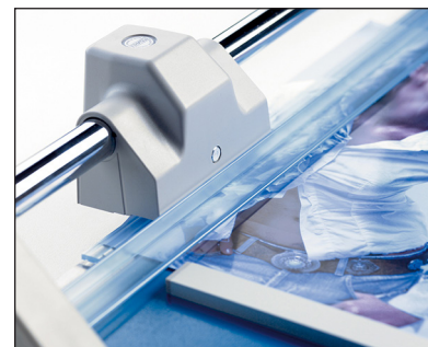
Automatic clamp holds work securely and prevents shifting while trimming.