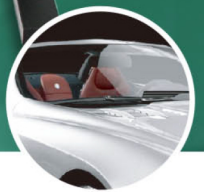
▶ Window Tint Film