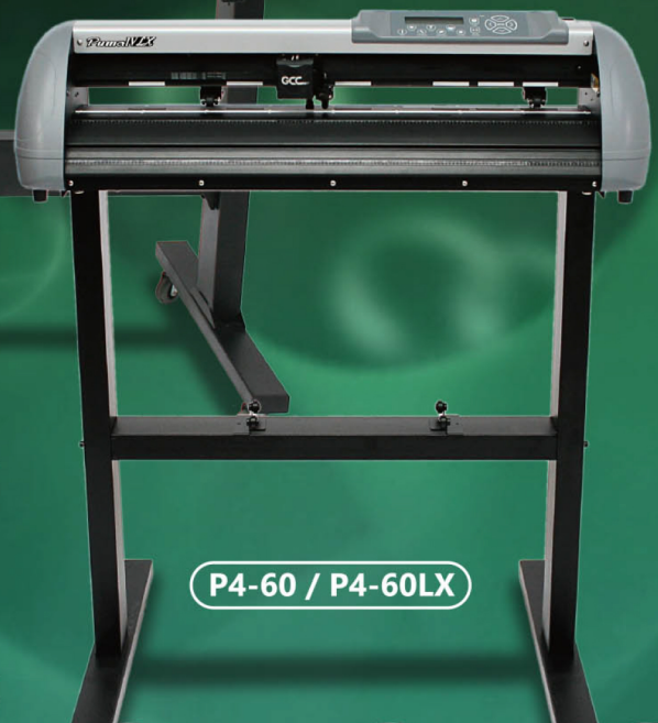
P4-60 / P4-60LX