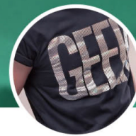
▶ Heat Transfer Film