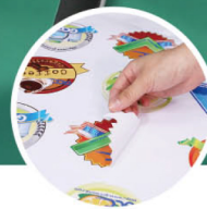
▶ Vinyl Sign/Custom Decal