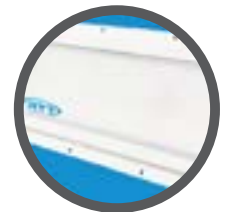
5-Year Warranty LED Lighting