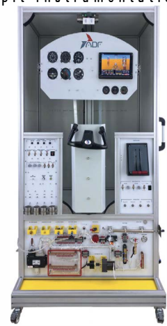
CBT-100B Advanced Aircraft Cockpit Instrumentation