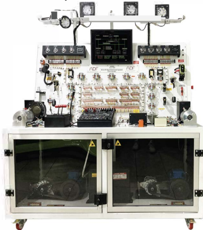
ELC-100D Aircraft Dual Electrical System Trainer