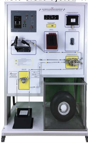
SKT-100B One Wheel Anti-Skid and Auto Brake System Trainer