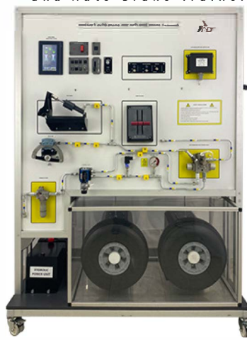
SKT-100A Two Wheel Anti-Skid and Auto Brake Trainer