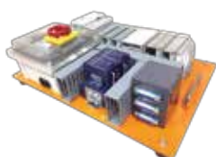
PLC Trainer AllenBradlyCompactLogix