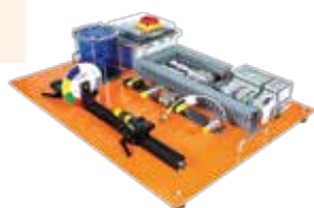
Control Devices Trainer