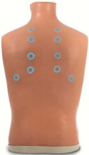
Illuminated auscultation sites.

Lung Conditions: Bronchovesicular, Bronchial, Cavernous, Coarse Crackle, Egophony, Fine Crackle, Friction Rub, Mono Wheeze, Normal Lung, Pectoriloquy, Pulmonary Edema, Rhonch, Stridor, Vesicular, and Wheeze.