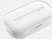
UVC Sterilizing Wireless Charger