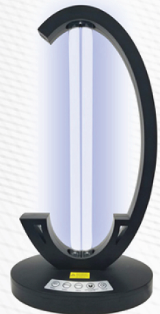
UVC Room Sterilizer