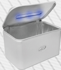
UVC Sterilization Bag