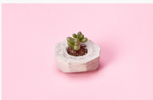
Concrete cactus pots