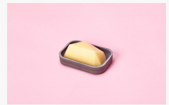
Geometric soap and the dish for it to live in