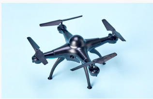
An aerodynamic drone casing