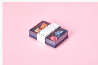
A box of chocolates and packaging