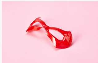
A set of coloured superhero masks