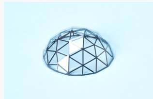
Mock up glasswork for a geodesic dome