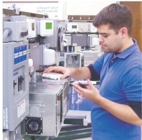
Our programs include realistic, hands-on trainers

Individual certification endorsements include: Audio-Video, Computer Networking, CCTV, Security-Surveillance, Environmental Control