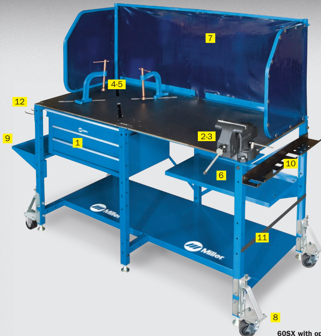
60SX with optional accessories