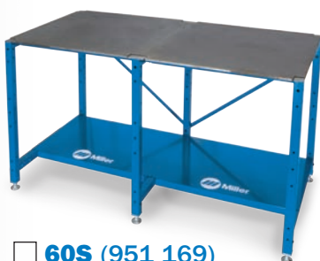
60S (951 169)

Tabletop style 3/8-in X-pattern tabletop Weight 177 lb (80 kg) Dimensions 30 x 30 in (35 x 29 x 29 in)