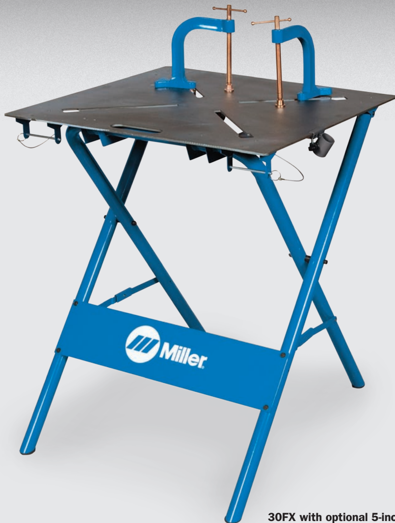
30FX with optional 5-inch X-clamps