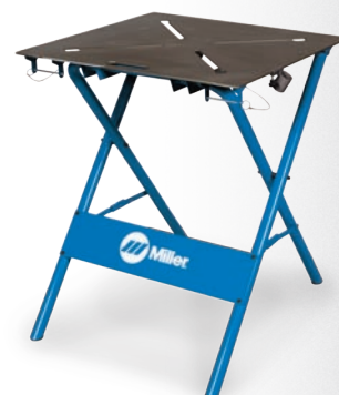
30FX (300 837)

Tabletop style 3/16-in X-pattern tabletop Weight 74 lb (34 kg) Dimensions 30 x 30 in (35 x 29 x 35 in unfolded, 6 x 29 x 48 in folded)