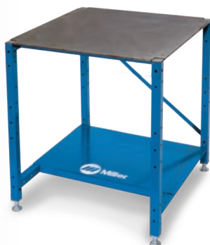
30S (951 167)