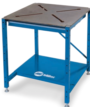
30SX (951 168)

Tabletop style 3/16-in solid tabletop Weight 123 lb (56 kg) Dimensions 30 x 30 in (35 x 29 x 29 in)