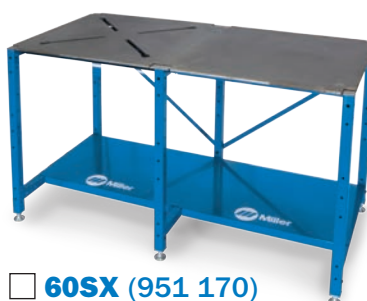
60SX (951 170)

Tabletop style 3/16-in solid tabletop Weight 230 lb (104 kg) Dimensions 30 x 60 in (35 x 58 x 29 in)