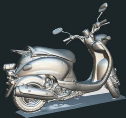
3D scan large objects like a motor scooter