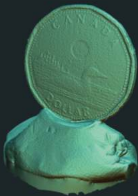
3D scan the tiny details of a coin