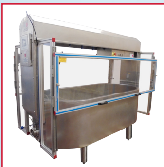
CCDC Computer Controlled Teaching Curdling Tank