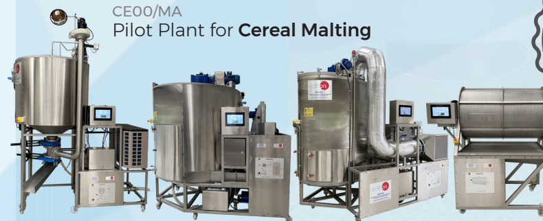
CE00/MA Pilot Plant for Cereal Malting

Design of PILOT PLANTS under your requirements