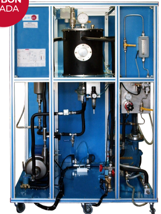
AEHC Computer Controlled Hydrogenation Unit