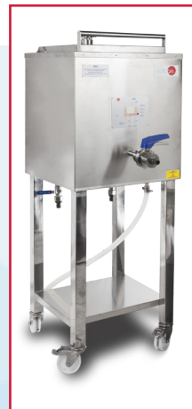
RDC Computer Controlled Teaching Cottage Cheese Maker