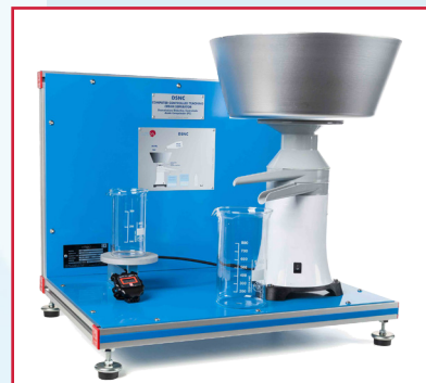
DSNC Computer Controlled Teaching Cream Separator