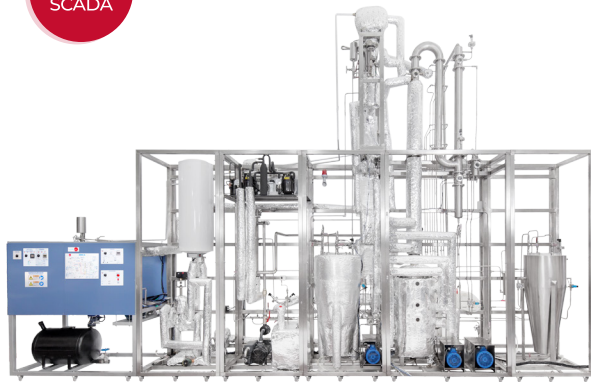
AEDC/A Advanced Computer Controlled Deodorizing Unit