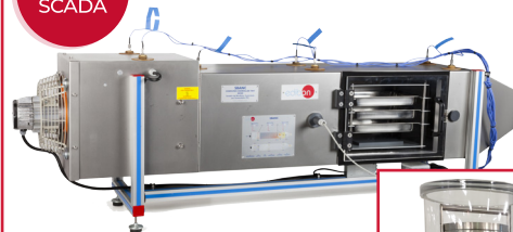
SBANC Computer Controlled Tray Drier