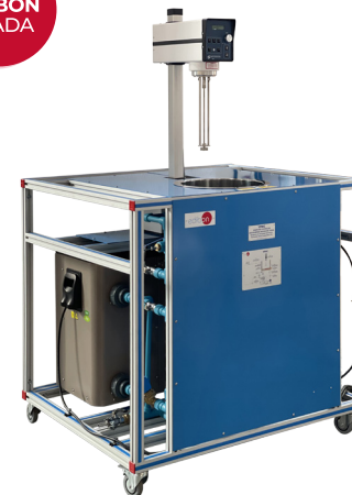
VPMC Computer Controlled Multipurpose Processing Vessel