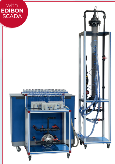
EFLPC Computer Controlled Deep Bed Filter Unit