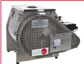
EMANC Computer Controlled Butter Maker Teaching Unit