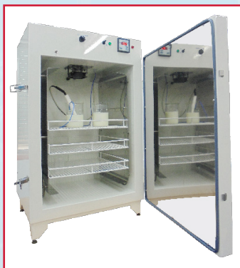
IYDC Computer Controlled Teaching Yogurt Incubator