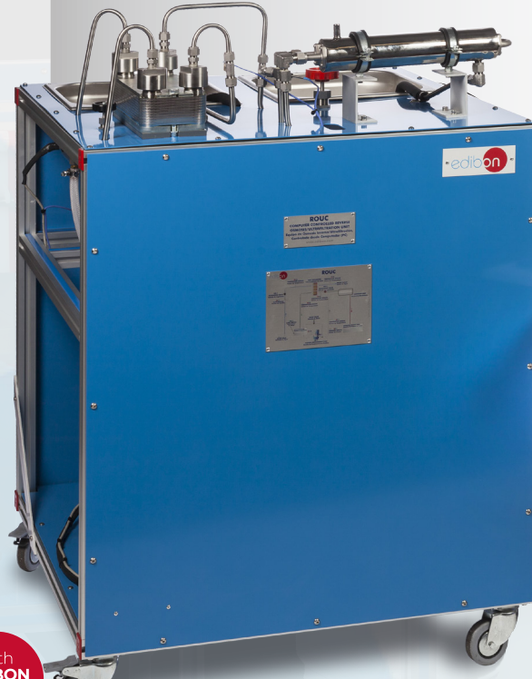
ROUC Computer Controlled Reverse Osmosis/Ultrafiltration Unit