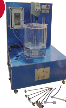
PEAIC Computer Controlled Aeration Unit