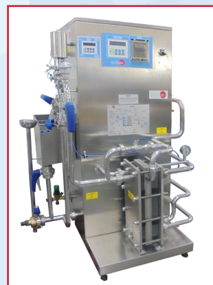
PADC Computer Controlled Teaching Autonomous Pasteurization Unit